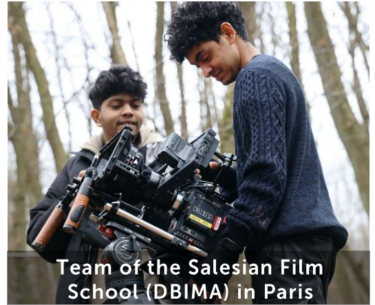
Team of the Salesian Film School (DBIMA) in Paris

Our aim at DBIMA extends beyond producing high-quality videos; we entrust young minds with the task of crafting content for the young themselves. Rooted in our mission to instill Christian values irrespective of faith backgrounds, we engage students in initiatives like CaglieroLIFE. Here, they delve into media work, using filmmaking as a means to explore and articulate moral and ethical principles. Through this project, students create short films inspired by ideas from the Missions Sector, fostering personal growth, introspection, and skill enhancement within a mission-centric approach to media education.